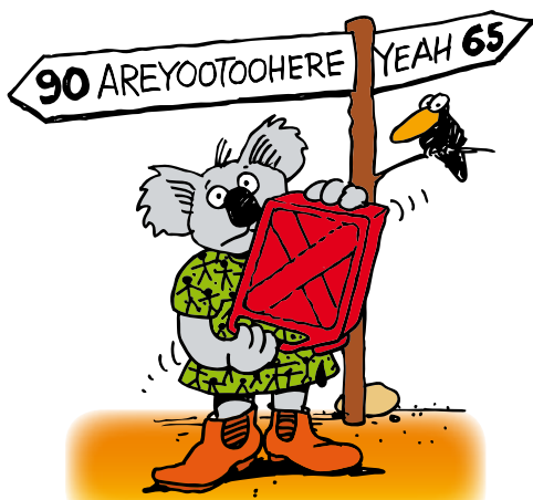
Figure out the shortest way for them to reach their campsite in Tentofield. They will have to fill up with petrol on the way. Distances are given between the black dots on the map. Towns with petrol are marked with a P.

On the way to camp Koalinda and Joey ran out of petrol. Luckily they had just enough in their spare tank to take them another 100 kilometres.